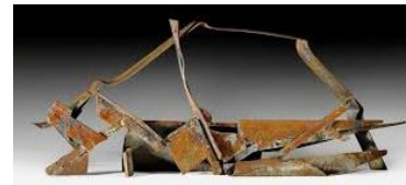
Ruth Asawa (January 1926 - August 2013)